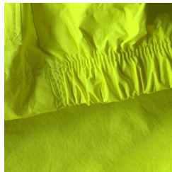
PROTECTION Half-elastic waist.