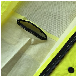
SAFETY Fall protection access.

ArcLite Air will be YOUR choice for FR rainwear.